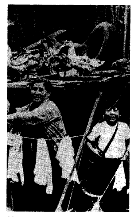
Shantytown near Lima.

c. The three instruments of the revolution. To make revolution there must be a Communist Party as the leading and highest form of organisation; a revolutionary army as the principal form of organisa-