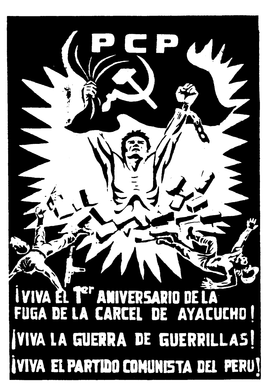
"Long live the First Anniversary of the Ayacucho Prison Breakout! Long Live the Guerrilla War! Long Live the Communist Party of Peru!"

Castro can read and knows very well what the PCP thinks of all forms of revisionism, Castro-type included. The PCP has made it plain to all who care to know that it is leading a revolution to liberate Peru from imperialism and serve the world revolution and not to follow Castro in trading one imperialist master for another. Perhaps here Castro is following a policy noted before among some pro-Soviet forces, of on the one hand attacking and defaming the PCP and on the other leaving the door open to try to seek some advantage by dressing up as possible allies of the revolution. But with this offer of sympathy and understanding to Peru's future chief executive executioner, faced with what is apparently the most horrible thing Castro can imagine, "Sendero Luminoso," Castro is certainly making a contribution to clarifying