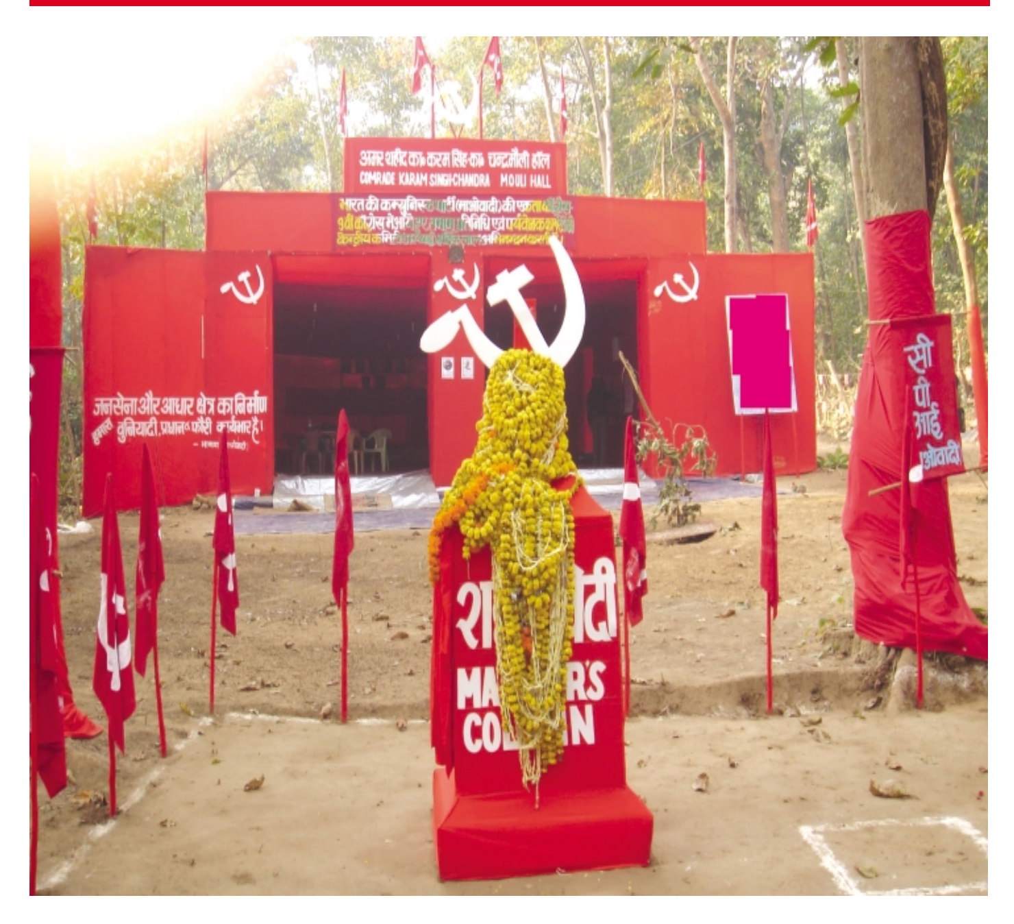
HAIL Historic Unity Congress-9th Congress of CPI (Maoist)