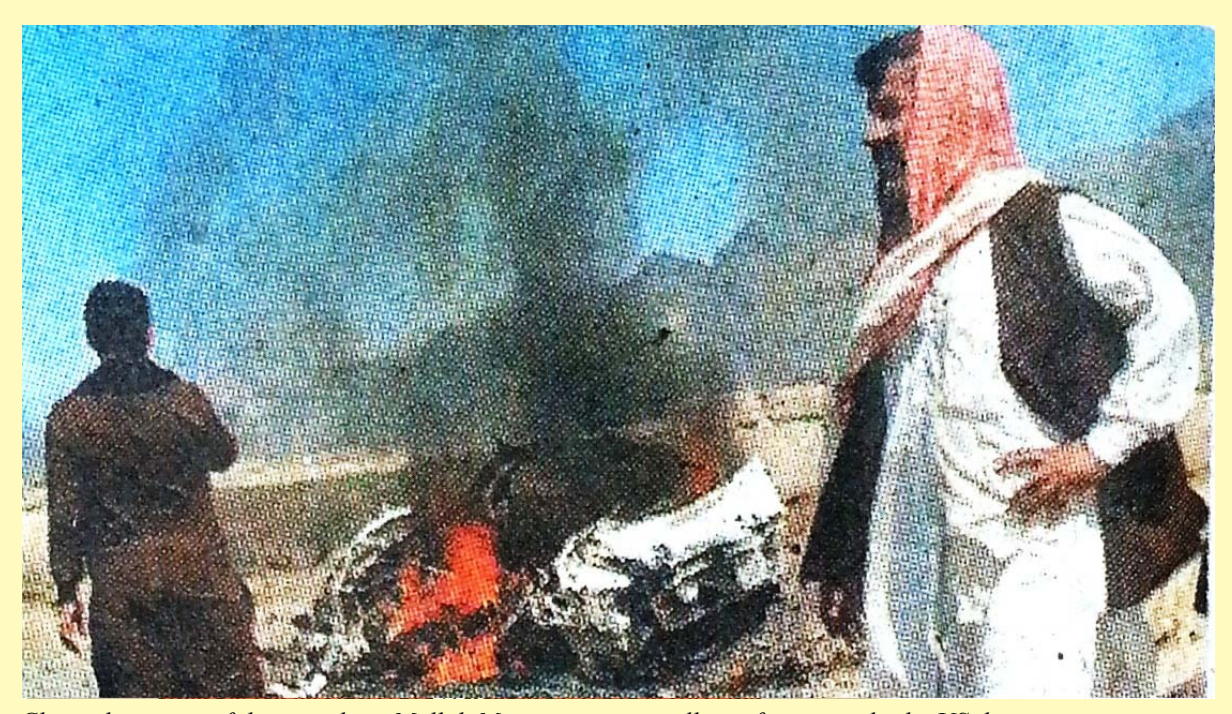
Charred remains of the car where Mullah Mansoor was travelling after it was hit by US drone

The US government carried out this drone strike in blatant violation of Pakistan's sovereignty and with the full cooperation and consent of its comprador ruling classes to weaken the resistance forces of occupied Afghanistan, just as it did in the case of the killing of Osama bin-Laden a few years back. Apart from Afghanistan and Pakistan, the US and its allies are conducting similar drone strikes in North African and West Asian countries with impunity, often targeting the people's armed resistance forces fighting imperialism and their mass base, often killing civilians including the old and the young in large numbers. US imperialists have not spared even hospitals, schools, ambulances and other such civilian installations as part of their inhuman bombing raids. MIB condemns the killing of Mullah Monsoor by the US imperialists and expresses its solidarity with the resilient national liberation struggle of the heroic and indomitable people of Afghanistan. They will certainly overcome this loss and continue their armed resistance to ultimately bury US imperialism in the soil of Afghanistan as they did to other imperialist powers in the past.