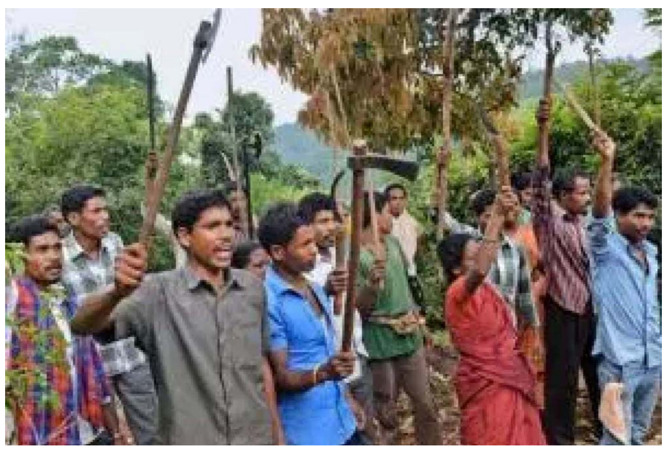
Adivasi peasants of Visakha Agency Area of AOB in an armed demonstration against bauxite mining

distrust for the government. They accuse the leadership of the established parliamentary parties of selling-out to the big mining companies and bartering the collective interest of the masses for a few crumbs.