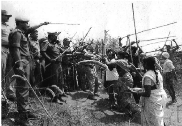
Repression and resistance around the 'Haritaharam' project in Telangana

programme. The leaders of the movement are targeted and arrested. The police are also used to forcibly take possession of the land and guard it. It is using such repressive measures as mowing down standing crops of the peasants and planting the land with saplings. The police are coming in the night with tractors and destroying the crops. The government is brining workers from Chhattisgarh to work in the plantation after the local people refused to work. Policemen from Gundala, Kanchanpalli, Bodu, Kottagudem, Yellendu, Alepalli and Tekulapalli Police Stations were mobilised to acquire 120 acres of land in Oddugudem village of Khammam district. Over 200 policemen converged in the village and lathicharged the resisting people. Many villagers were injured, some were arrested and jailed. After some of them came out on bail, they were re-arrested from the jail gate and sent back on fresh charges.