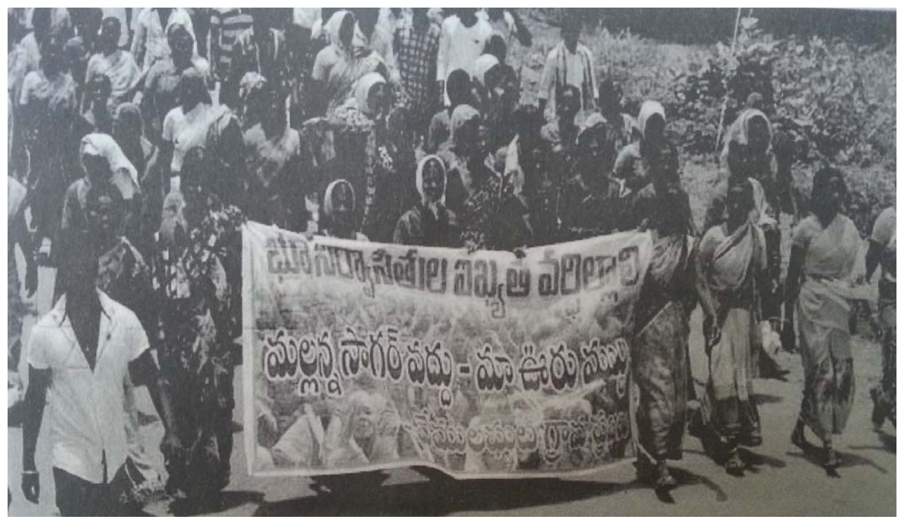
Mass protest against Mallannasagar project

capitalists but the masses will have no benefit from it. Also, the aim is to give some of the land acquired for the project from the peasants to big business houses. Water will also be supplied to big industries.