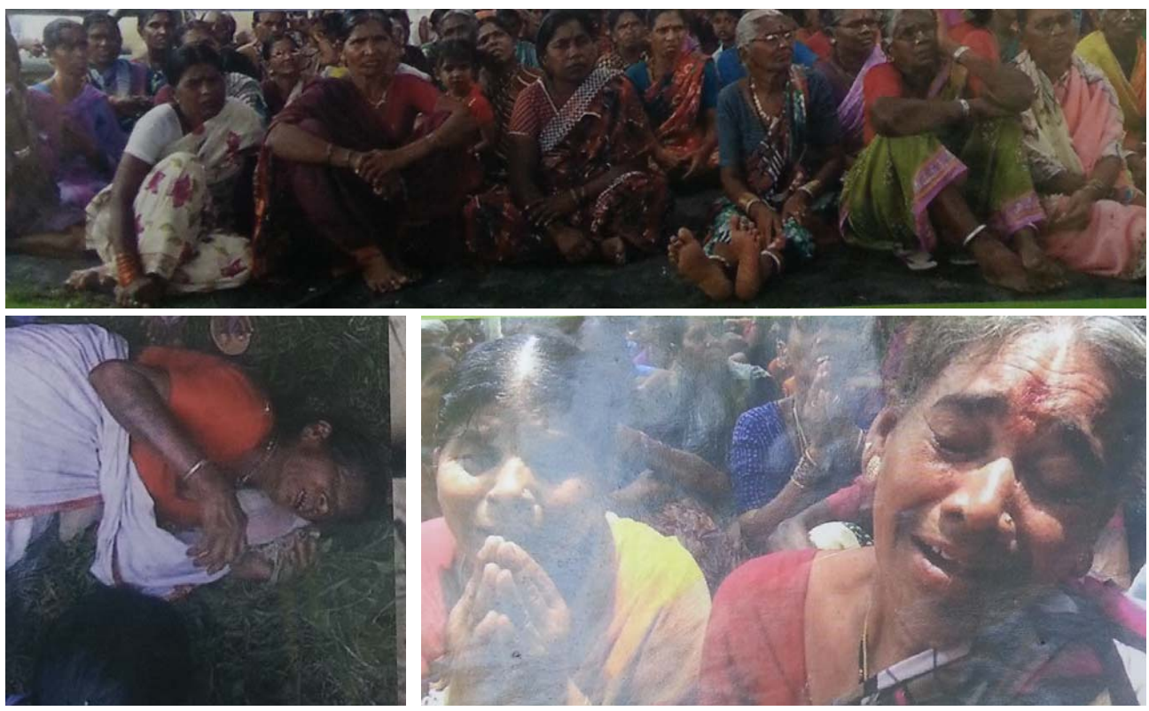
Police brutality on women protestors agitating against Mallannasagar project

The treacherous KCR government is using police forces to suppress the people. It has imposed Section 144 in the areas earmarked for land acquisition. The government has even acquired some land with permanent titles as after court's orders against it. The people are strongly opposing the Haritaharam