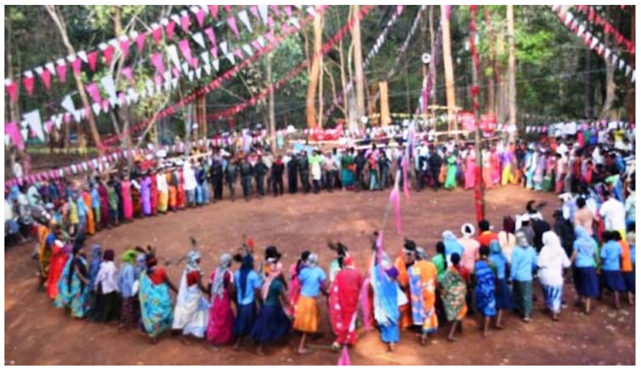
Adivasi and non-Adivasi people taking part in collective dance during 'Kala Dhuka'

purpose of the event was to strengthen and emphasise the progressive and democratic aspects of people's culture which are under increasing attack from the poisonous imperialist and feudal ruling-class culture. A large number of cultural troupes from different Areas gave performances. They also participated in group song and dance competitions. The programme continued till the afternoon of 3 March and was brought to a conclusion with the singing of the Internationale.