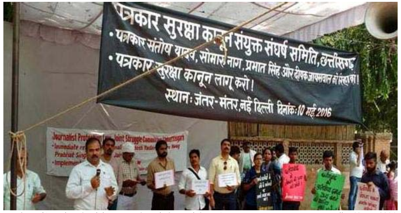
Members of 'Patrakaar Suraksha Kanoon Sanyukt Sangarsh Samiti' protesting at Jantar Mantar, New Delhi, 10 May 2016

The team also found that the "Samajik Ekta Manch is funded and run by the police headquarters in Bastar. According to them it is a reincarnation of Salwa Judum." The Guild demanded that journalists should be given the freedom to carry out their professional work and the government should stop threatening or persecuting them. They