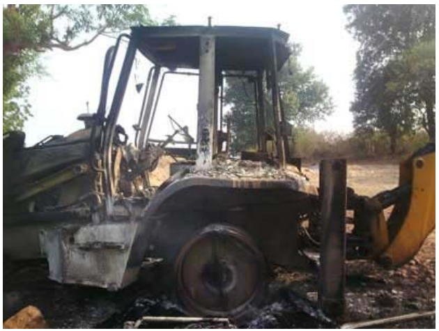
JCB machine engaged in PMGSY road building in Daliakuji village, Rayagada burnt by the PLGA

On 26 January, PLGA cadres torched a JCB machine and a tractor engaged in the construction of a road under Pradhan Mantri Gram Sadak Yojana (PMGSY) in Daliakuji village of Hatamuniguda Gram Panchayat in the Niyamagiri Hills under Muniguda Police Station of Rayagada district. They put up posters and banners at Dhepaguda Chowk and in Parsali village inhabited by Kui Adivasis against the deceptive reform programmes of the BJD government. The Maoist Party gave a call to the Adivasis to get organised in a