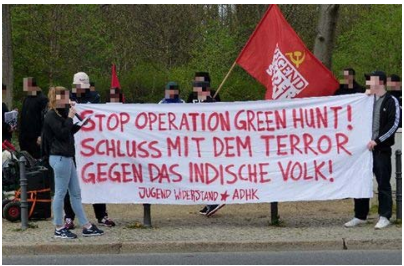
Protest against Operation Green Hunt, Brussels, April 2016