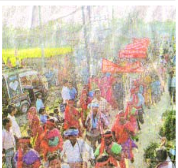
Nari Mukti Sangh leading a mass campaign against witchcraft and superstition in Jharkhand, May 2015