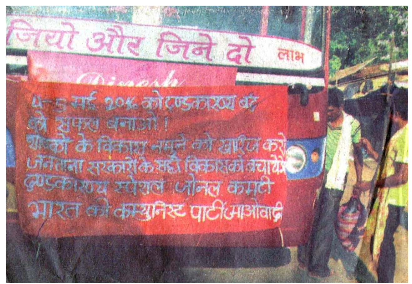
DKSZC banner on a passanger bus calling for Dandakaranya bandh on 4-5 May