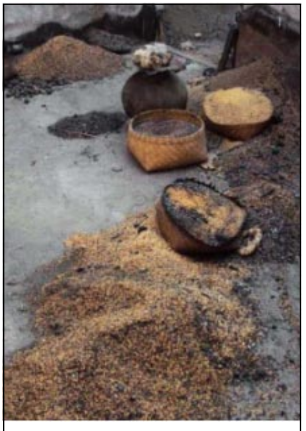
A burnt house and granary in Tadmetla

It maybe recalled that these three villages were attacked and burnt down by COBRA and Koya Commanders and SPOs of the Chhattisgarh Police on March 11 and 16, 2011. The plan of the Government of Chhattisgarh is very clear, which is to use the front of the Salwa Judum and SPOs and