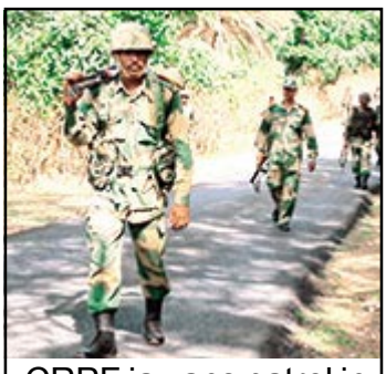
CRPF jawans patrol in Dantewada

So far, 35 of 83 districts in Naxilite-hit states, including West Midnapore, were named "focus" districts. But the government has now raised the number to 60. Some of these districts are believed