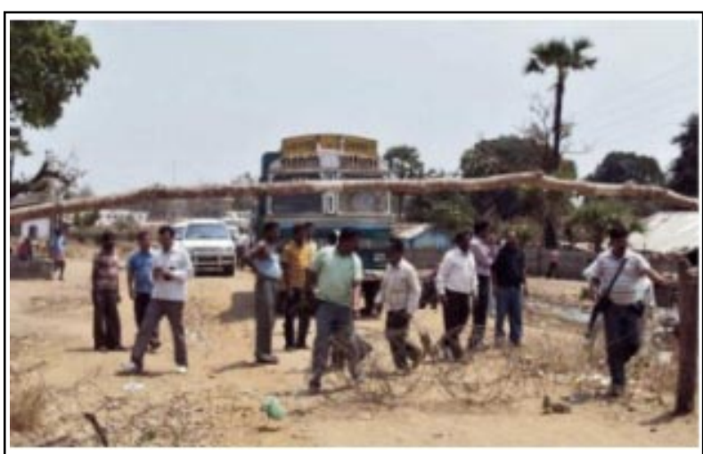
Blocked: Salwa Judum members erect barricades to prevent the Collector from reaching the villages

Even before the public hearing there has been violence against this power company's offices by those opposed to the power project. Days before the hearing, Dainik Bhaskar