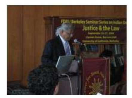
DGP Vishwa Ranjan