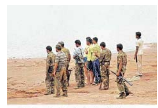
Greyhounds waiting for the dead bodies

the fish they resort to the most brutal and inhuman methods against the people. In some villages as in Nallamala forest region, Adilabad and Khammam forests in North Telangana, and forest areas of Vishakhapatnam, East Godavari, Srikakulam and Vizianagaram districts of North Andhra, adivasi inhabitants are forcibly evacuated and herded into specially constructed camps or relocated to new villages. In neighbouring Chattisgarh this has become the main form of containing the Maoist movement. And in the forest areas of Chattisgarh bordering AP it is the AP Greyhounds that carry out this operation to flush out the Maoists by evacuating the tribal hamlets. Arrests, harassment and murders of revolutionary activists, sympathizers and innocent people in the Maoist strong-holds are the general guidelines for these mercenary forces. Recently, in the month of February