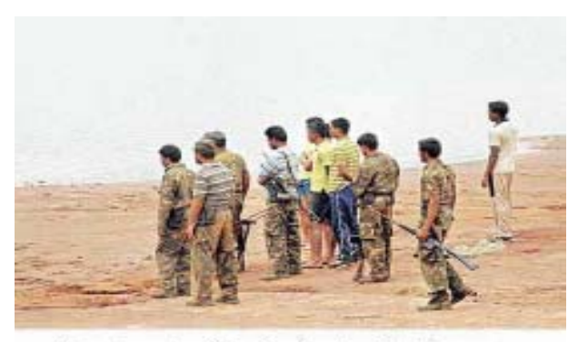
Greyhounds waiting for the dead bodies

Bhaskar: Well, the tendency is generally to write off a movement if there is no big action against the state's forces or political leaders for a while. Just because there is no effective blow from the Maoists the rulers boast that they have finished off the Maoists and the media propagates these stories. And when there is one big action the very same people present a totally different picture. And the media talks of the phenomenal growth of the Maoist movement and the grave threat it posed to the security of the country. We should not merely come to an assessment based on one or two actions but take a more balanced view by considering various factors.