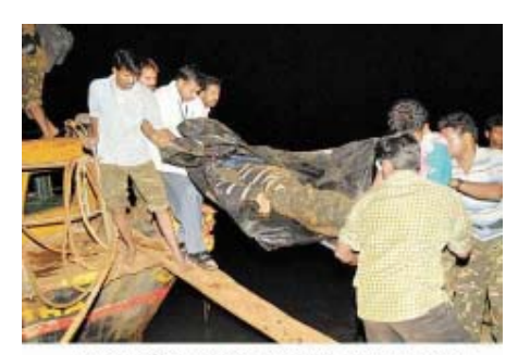
Dead bodies being brought to the shore

After the incident the gravely-shaken Chief Minister and Home Minister of Andhra Pradesh, in order to boost up the sagging morale of their pet force, announced an ex gratia of Rs. 10 lakh, a 200-square yards of house sites to each of the families of the dead, government job to one member in the family and free education to the children in the family. The Home Minister's emotional outbursts and fits of rage were uncontrollable. He cried out for revenge like a "street rowdy" as aptly described in a statement issued by a Maoist spokesperson. Swooning like a deranged person afflicted with hysteria,