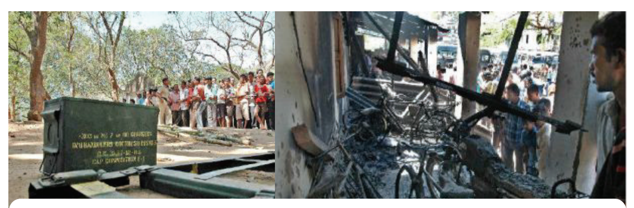
Emptied Nayagarh Armory - Modern Weapons seized by PLGA