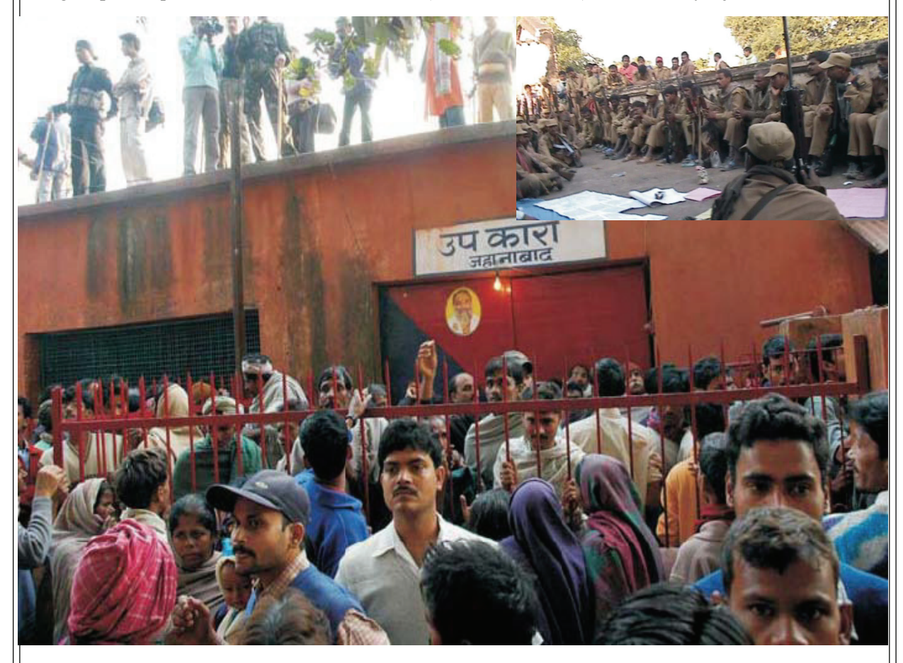
People throng to Jahanabad Jail after 'Operation Jail Break' (inset) the Raiding Forces of PLGA