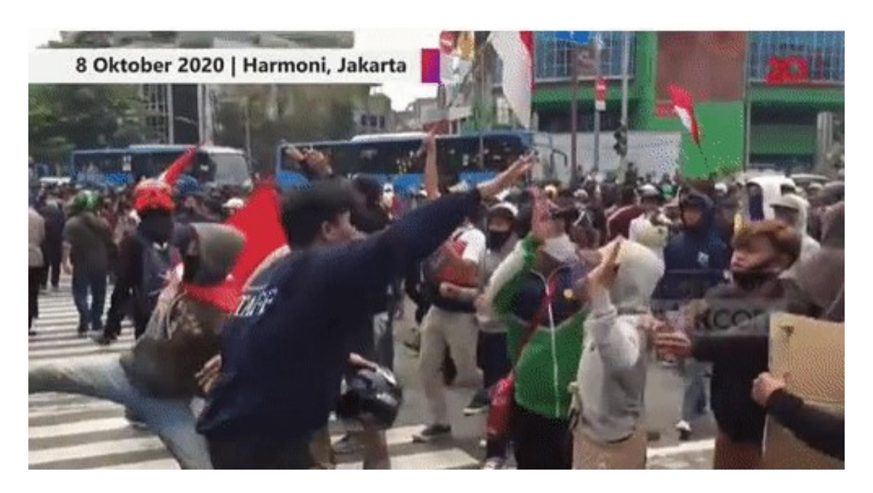
Indonesian protesters clashed with the police

monopoly firms at the expense of the farmers; they also protested the lockdown policies of the government, with 200 million participants, it was "the largest organized strike in human history".