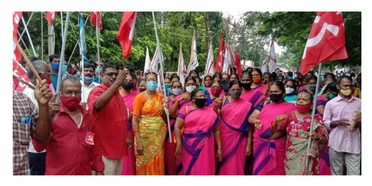
Indian weavers in Tamil Nadu