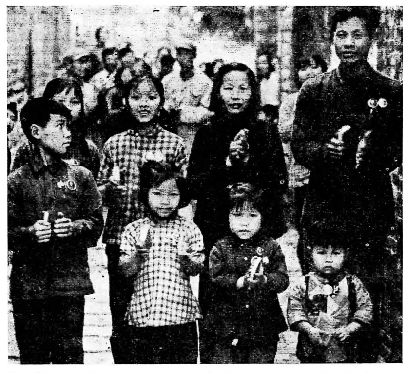
The Ding family, of the Lunghua Production Brigade, Po Lo County, Kwangtung. (See 'The Cultural Revolution and the family '.)