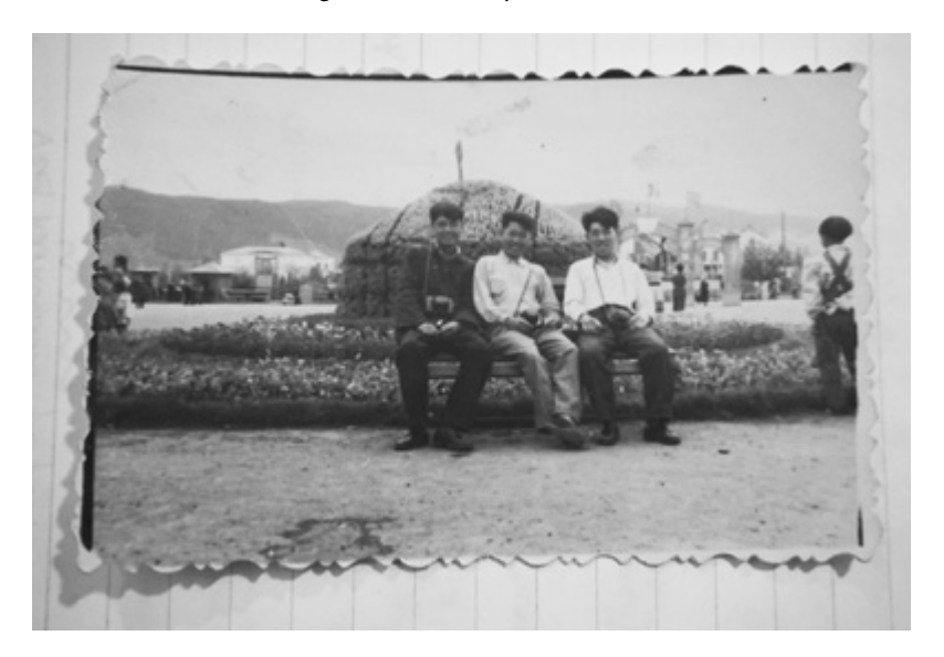
Three Chinese workers on the Sukhbaatar Square, circa 1960.

an inspection of apartments in Zuun Ail district of Ulaanbaatar, where more than 800 Chinese workers and their families lived. The report found that the 'building's wall was cracked' to such an extent that 'when the ground thaws in the spring, it might collapse'.<sup>39</sup> Additionally, 'the steam heating system had deteriorated. In some buildings, there wasn't any heat at all and frost started to appear inside, which was exacerbated by the fact that 'water leaked from the ceilings' in several apartments. The report concluded that 'even Mongolians would not want to endure living in such a building, let alone Chinese' (ene bairand khyatad baitugai mongol khün ch tesej suumaargüi baina), who were not used to living in an environment where the temperatures in winter could easily drop to minus forty degrees. To make matters worse, the Mongolian Deputy Minister of Construction, who was supposed to accompany the inspection team, was several hours late—a 'disrespectful situation' noted by the Chinese side. The lateness was not out of character for Mongolian diplomats, who, according to Balázs Szalontai, frequently engaged in 'subtle insubordination' towards their more powerful neighbours; in 1960, for instance, Soviet diplomats lodged a 'formal complaint against their ill-treatment at the hands of various Mongolian cadres', while North Vietnamese diplomats complained about 'recurrent shortages of electricity and water'.40