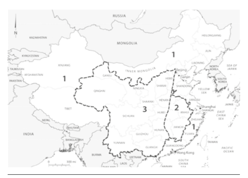
Figure 1. Map of the First, Second, and Third fronts. The author owns the rights to this map.

Deng and other top Party leaders did not immediately back Mao's call to undertake such a big developmental drive to bolster national security. They instead recommended conducting preparatory surveys and drawing up plans for a few select projects. This policy stance was based on their concern about launching an industrialisation campaign like the Great Leap Forward (1958–62), during which the central government had decentralised authority to localities and commanded them to mobilise local resources to quickly expand China's industrial base. In the end, the Great Leap led to economic and administrative disorder and a famine that killed tens of millions of people.<sup>7</sup>