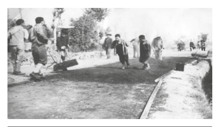
Figure 3. Building a road for a Third Front factory.

at not knowing when, if ever, they would see one another again. The hundreds or thousands of kilometres they had to travel before arriving at their destination reinforced the feeling of how far they were going from home. Their sense of heading into the middle of nowhere was further enhanced by the fact that, for most, their future workplace could only be reached by a truck-ride, snaking for hours, if not days, up dusty mountain roads. Although rural folk generally had to travel shorter distances to their new workplace, they rarely had the luxury of motorised transport and had to instead walk for tens or hundreds of kilometres along rugged mountain routes.<sup>20</sup>