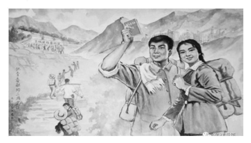
Figure 2. Third Front mobilisation poster.

Urban residents were particularly distressed because going to the Front amounted to a socioeconomic demotion. Instead of living in a city in China's northeastern or coastal industrial heartland, they would have to reside not just in the underdeveloped interior, but in its mountainous hinterlands. In many cases, when workers were mobilised, plans for their new workplace were still on the drawing broad, and construction had yet to begin. Workers were anxious about the sort of life that awaited them in this industrial world that they would have to build themselves. What sort of housing, medical facilities, and cultural activities would there be? Would there be schools for their children, and would they be any good? What would local weather and food be like, and would they be able to adapt? Would they be able to understand the local dialect? And, perhaps most importantly, when could they come back and live again with their family and friends?<sup>16</sup>