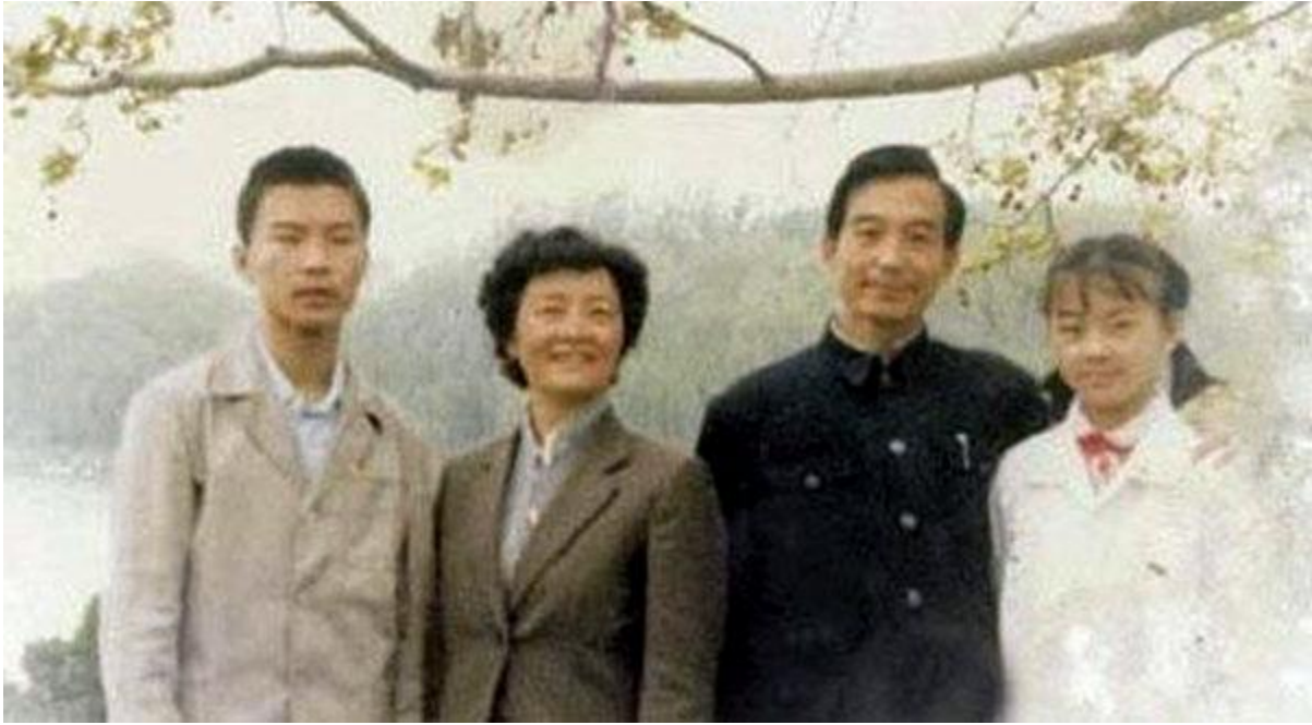
[Wen Jiabao, second from right, with his wife and children in the 1980s, when they were only capitalist roaders, and not yet billionaires themselves.]